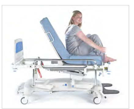
Chair with high foot supports and handgrips