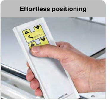
Electrically operated height and backrest adjustments reduce handling risks.