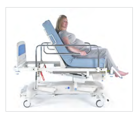
Chair position with low foot supports and safety sides raised