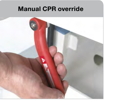
Dual-sided levers lower the backrest instantly in the event of an emergency.