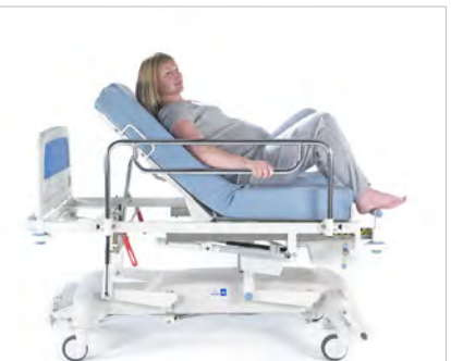
Semi-chair position with high foot supports and Chair position with handgrips and step safety sides raised