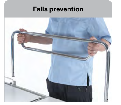
Adjustable safety sides, fitted as standard, are removable when not required.