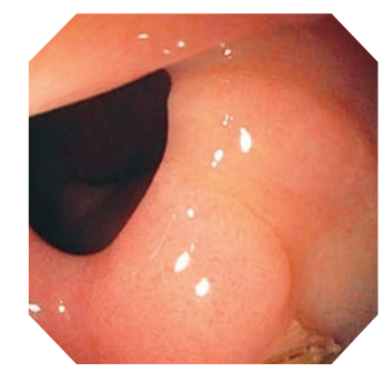
White light

A new connector design minimises the effort required for setup prior to and in between procedures. In addition, it is fully submersible and eliminates the need for a water-resistant cap and the associated risk of a major repair due to accidental immersion.