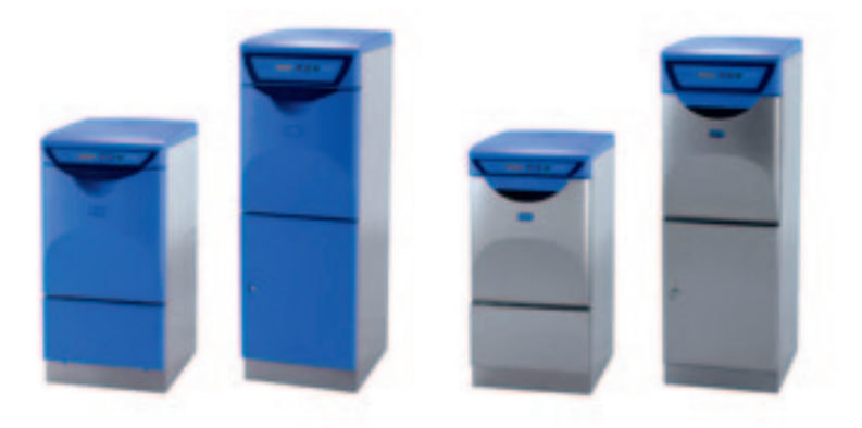
Getinge FD1600 polymeric, under counter and free standing