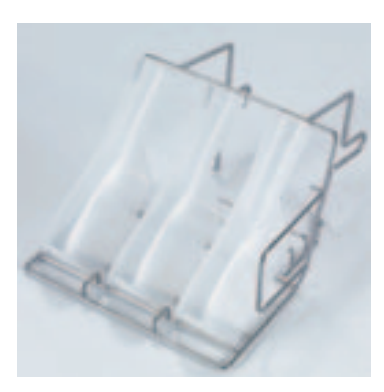
Three urine bottles