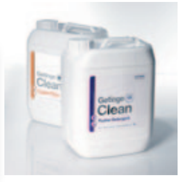
Getinge Clean flusher range

Getinge's range of detergents has been developed, tested and validated on Getinge's flusherdisinfectors for human waste containers to meet EN ISO 15883 standards for cleaning efficiency of goods commonly found in sluice rooms and to protect users and patients.