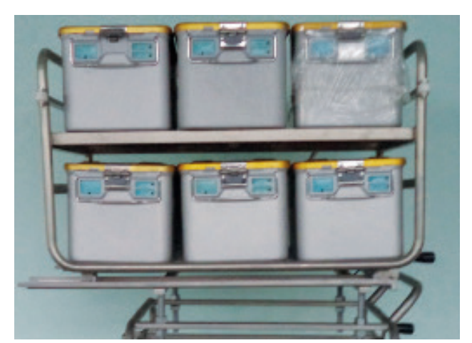
Manual loading of containers or various packs using a loading platform and loading module on a loading trolley. Also using optional loading module(s) to process containers