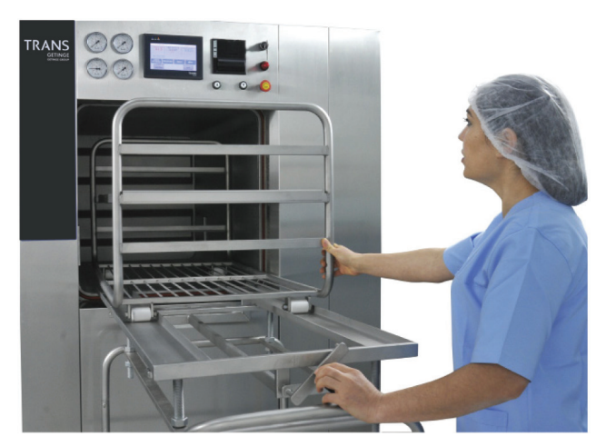
Manual loading/unloading of wire baskets

Trans – Getinge's new mid-range product line – offers a complete, efficient, economical, ergonomical handling systems for baskets as well as containers. The systems may be used separately or in combination. And both systems are available with manual or loading and unloading. This means that your system can be tailored to your needs.