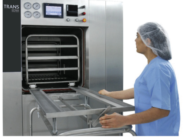
Manual loading/unloading of shelf rack