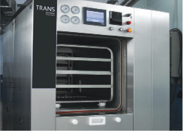
The shelf rack can also be loaded with wire baskets or other goods.